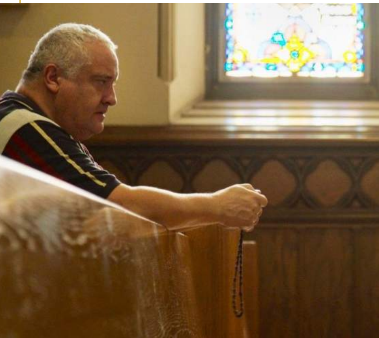
MAN PRAYS ROSARY AT THE ROSARY SHRINE OF SAINT JUDE