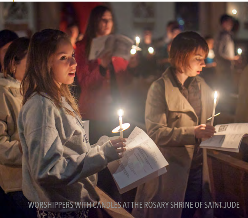
WORSHIPPERS WITH CANDLES AT THE ROSARY SHRINE OF SAINT JUDE

Our early morning sentinels confirm this story. Many people come in way before the first Mass-goers. With all the alacrity and efficiency they bring to their commute, our vanguard of prayer find their way to an accustomed altar or shrine to offer the morning's petitions, intercessions, or thanksgivings. After a few minutes of quiet intimacy they are gone, off into a day whose long hours belong to another. From dawn to bedtime workday thoughts will crowd the mind, but the light remains behind as a sign that the heart never loses its Sunday longings.