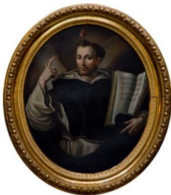
SAINT VINCENT FERRER, WONDERWORKER