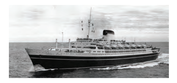
ON 25 JULY 1956, THE SS ANDREA DORIA COLLIDED WITH THE MS STOCKHOLM OFF THE COAST OF NANTUCKET WHILE BOUND FOR NEW YORK CITY. 46 PASSENGERS DIED.