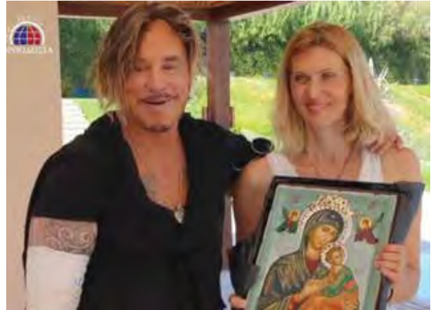
ACADEMY-AWARD-NOMINATED ACTOR MICKEY ROURKE

Years later when his brother died at the age of 50, Rourke stopped praying for several years. Father