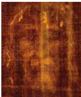
THE HOLY FACE OF JESUS CHRIST IS SHOWN IN THE CATHEDRAL OF SAINT JOHN THE BAPTIST IN TURIN, ITALY.

shroud folded twice and then fourfold. Saint John Damascene also described the Holy Image of Edessa as a large garment. It is interesting to note that the Shroud of Turin has this same fourfold pattern. Centuries later, in 994, the cloth was transferred from Edessa to Constantinople. Emperor Constantine VII described the image on it as “extremely faint, more like a moist secretion